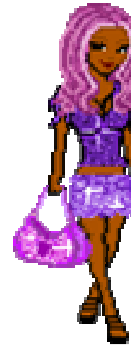
From: < http://myspace.free-clipart-pictures.net >. Access 02/10/2007

3. Go back to the descriptions and look for words related to the titles given below: