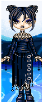
From: < http://www.thedollpalace.com > Access 14/11/2007