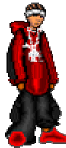
From: < http://www.kissdesign.net.000000pixel_maker > Access 14/11/2007